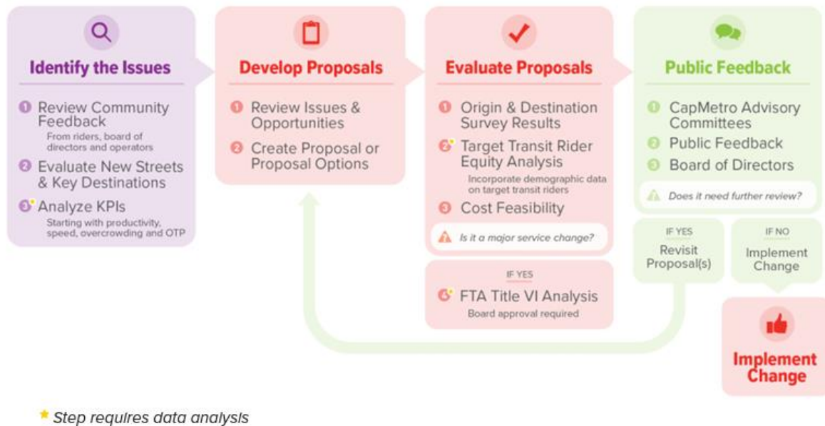
Figure 1: CapMetro Service Change Process

The proposed January 2024 service change process includes a robust community engagement phase that involves notifying elected officials, key stakeholders, and communities at-large, and soliciting input from potentially impacted interests. CapMetro will share information about its proposed January 2024 service changes, review community feedback, and summarize its community engagement efforts prior to bringing the proposed service change to the board for approval in October 2023. A public involvement plan is included in Appendix C.